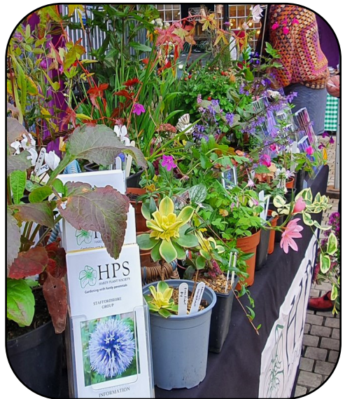
The Group Plant Sale Table at the Stafford Farmers Market...it never fails to look good on the eye.

During the 25 years of the Staffordshire Group's existence we have built up a very impressive portfolio of organising national events, as well as group events, taking part in many national and local shows and plant fairs.