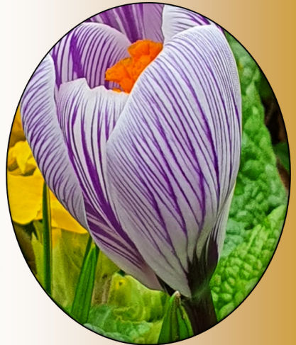
Crocus.. seen at Compton Acres Garden