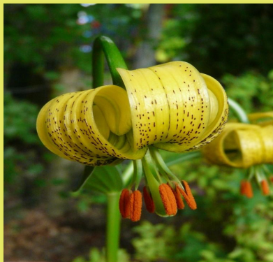
3rd. Emily Hamilton

Good picture. The flower really stands out. I like the diagonal placing.