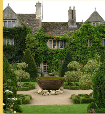
2nd. Geraldine Freeman

Beautiful! The eye is led down over the rounded shrubs and grasses like cascading water until they fix upon the kniphofia in the centre. Love the colours too.