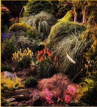
1st. Eileen Johnson

Beautiful! The eye is led down over the rounded shrubs and grasses like cascading water until they fix upon the kniphofia in the centre. Love the colours too.