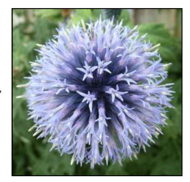
'Echinops Coronavirus' by Gerry Freeman (number 3)