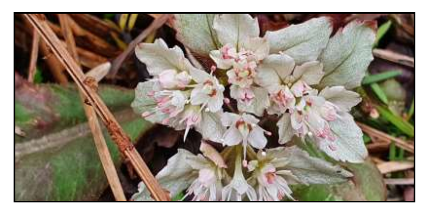
Chrysosplenium macrophyllum flowering in Ruth and Clive Plant's garden.

The reserves at 1 January 2021 stand at £6247.69 and it is clear that even if we are unable to meet properly again in 2021, or hold plant sales, the group is still on a sound financial footing as we continue serving the members in very uncertain times.