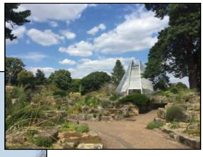
Number 3: ^ Bernie Norbury (Kew Alpine House)